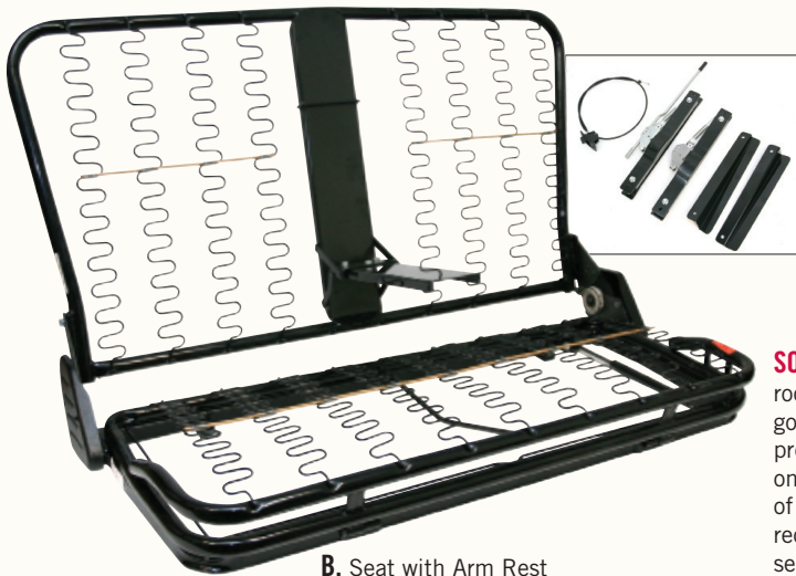
B. Seat with Arm Rest

SO-CAL Speed Shop Adjustable Seat: We put in a lot of seat time with our hot rods and there has always been room for improvement in the seating area. So we got together with the folks at Glide Engineering and improved an already dynamite product. The seat cushion flips up and forward to reveal a storage compartment for on-road essentials. Also featured is the angled base, with fore and aft movement of a full seven inches, allows for the tallest and shortest of drivers while the back reclines for additional comfort. It's ideal for roadsters, coupes and pickups. The seat is also available with an arm rest and a foam package which makes it even more versatile.