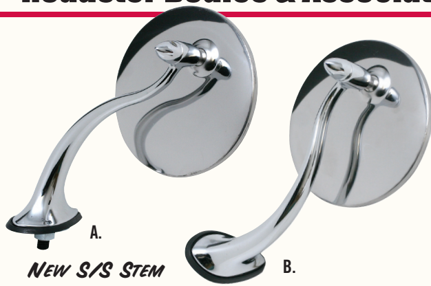
NEW S/S STEM

SO-CAL Swan Neck Outside Mirror: Now features a beautiful polished S/S swan neck design along with a 4" diameter stainless steel-backed mirror held in place by a sculptured bullet nut. Remember, these mirrors are great for all sorts of applications, including some fat-fendered cars, late models, pickups, VWs, etc.